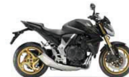
Mat Cynos Grey Metallic