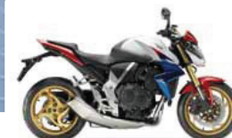
Pearl Cool White (Tricolour)