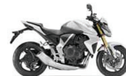
Pearl Cool White